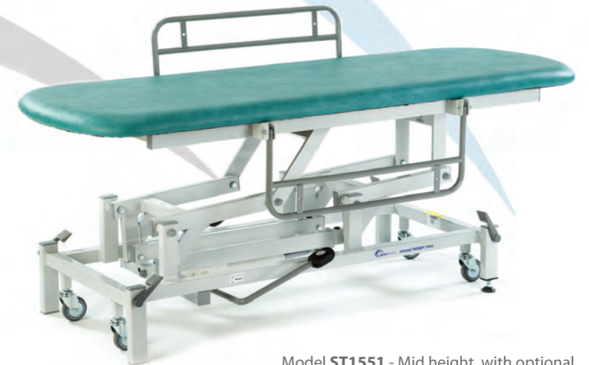
Model ST1551 - Mid height, with optional side support rails. Colour Lotus Green