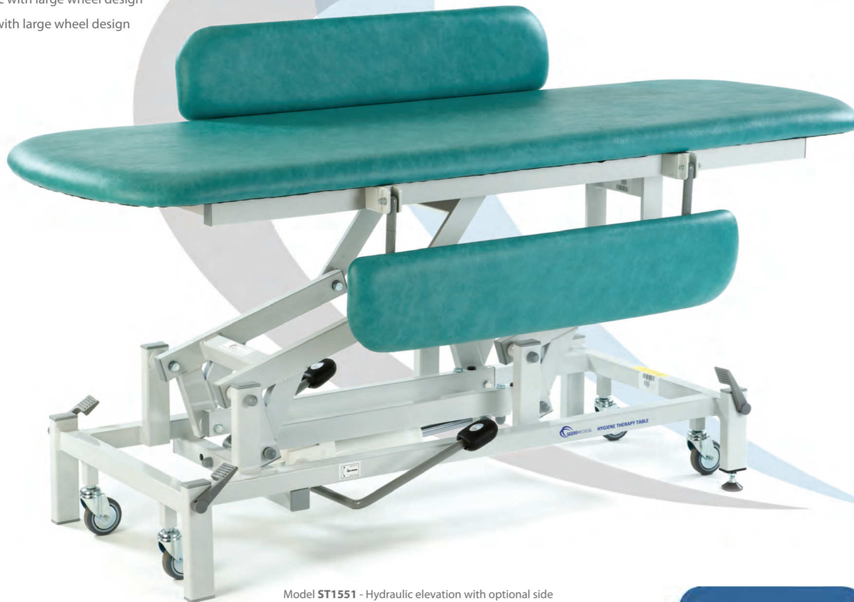
Model ST1551 - Hydraulic elevation with optional side support rails and cushions. Colour Lotus Green